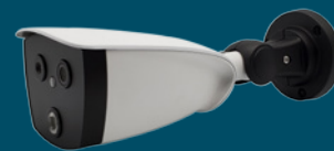
Thermal Network Camera