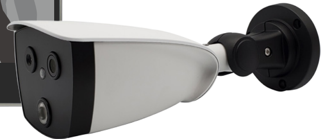
Thermal Network Camera