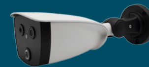
Thermal Network Camera